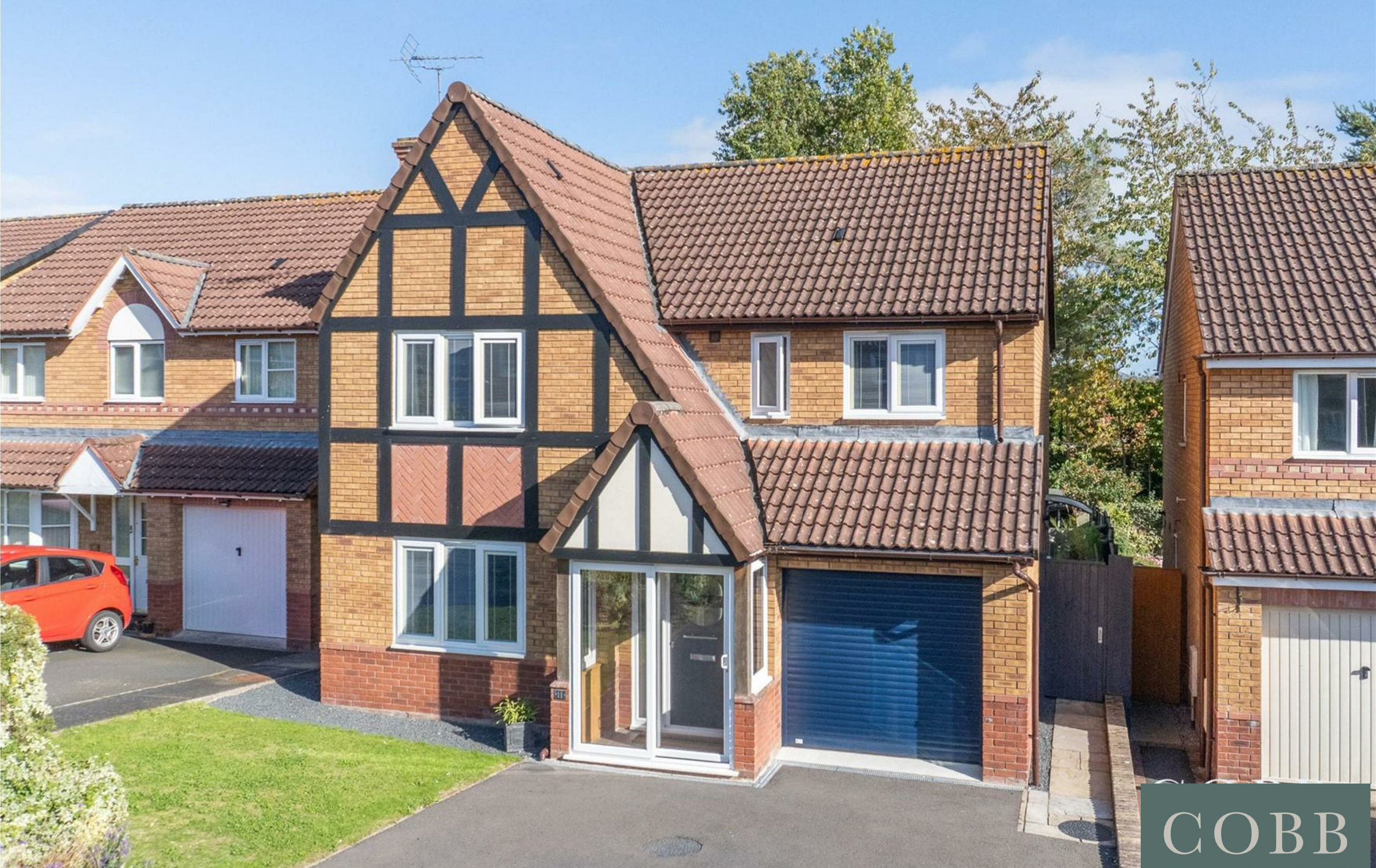
11, Ballard Close, Ludlow, SY8 1XH Price £425,000